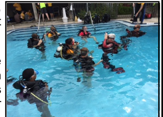
SCUBA Class Introduction